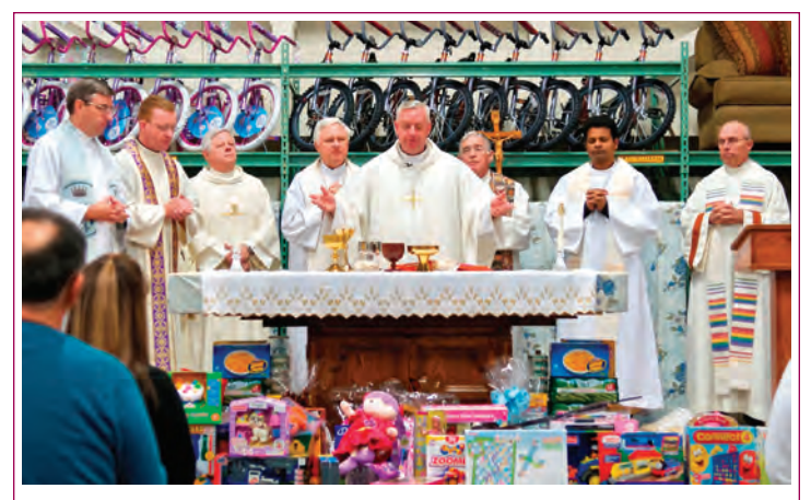
More than 700 community members gave thanks to God at this year's 20th Annual Gratitude Mass on Friday, November 26th.

2010 Assistance Programs... A Year in Review CHRISTMAS: 2,417 Deliveries 9,637 children & adults served FOOD: 3,501 Deliveries 13,858 children & adults served FURNITURE: 1,058 Deliveries 3,405 children & adults served