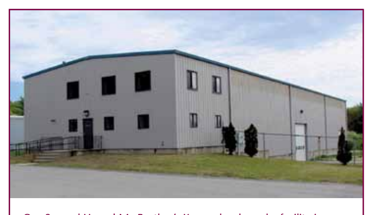
Our Second Home! My Brother's Keeper has leased a facility in Dartmouth, MA which will open in July. Coupled with our Easton operation, we will provide furniture assistance and "the Love and Hope of Jesus Christ" to struggling families in 50 towns between Boston and Fall River.

With the building, staff, and vehicles in place, we're in great shape to begin operations in Dartmouth in July.