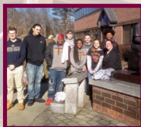
Cardinal Spellman Junior Day of Service January 30