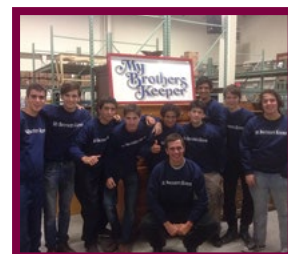
Exchange students from Argentina BC High, January 17