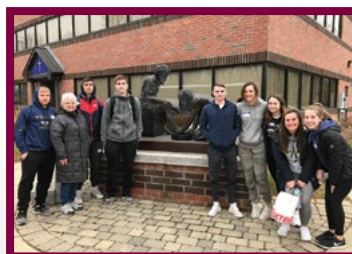
Archbishop Williams Junior Day of Service January 28