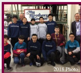
2018 Photo Exchange Students from China Easton Middle School, February 1

My Brother's Keeper places a very strong emphasis on student volunteering. Today's students are tomorrow's leaders and direct encounters with those we serve have a powerful effect on young people. Student volunteering is off to a strong start in 2019. Here are some of the groups we have hosted: