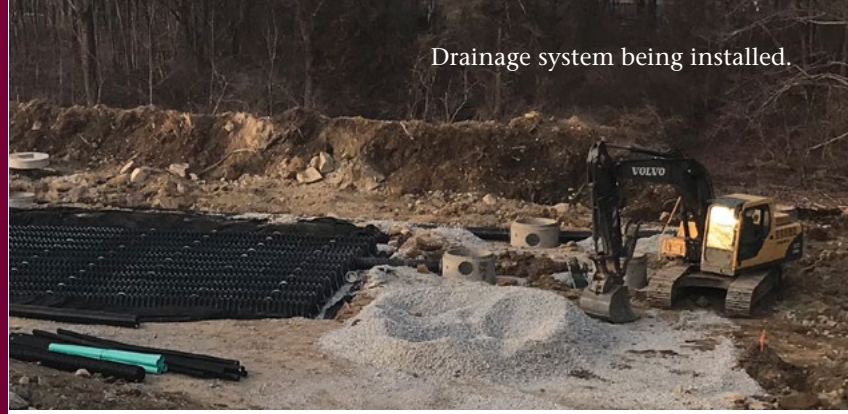
Drainage system being installed.

The Development Boards will continue to work in collaboration with our Board of Directors which is tasked with oversight and governance. The Board of Directors will continue to be one entity overseeing the ministry.