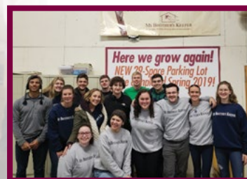
Notre Dame, Stonehill and Salve Regina Urban Plunge Retreat January 8-11