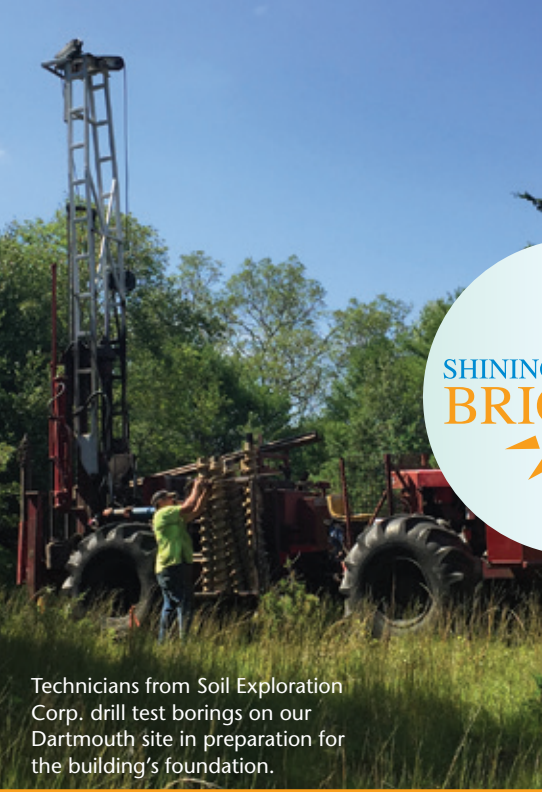
Technicians from Soil Exploration Corp. drill test borings on our Dartmouth site in preparation for the building's foundation.