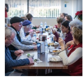
Easton facility, Spring 2002