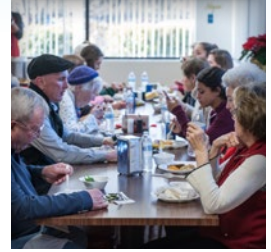
Easton facility, Spring 2002